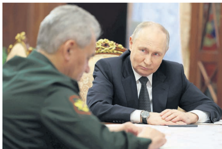
Russian President Vladimir Putin, right, listens to Russian Defense Minister Sergei Shoigu during their meeting at the Kremlin in Moscow, Russia, Tuesday, Feb. 20, 2024.

Putin didn't rule out possible future contacts with the U.S., but reaffirmed his view that Washington's push for Russia's defeat in Ukraine makes them impossible for now. □